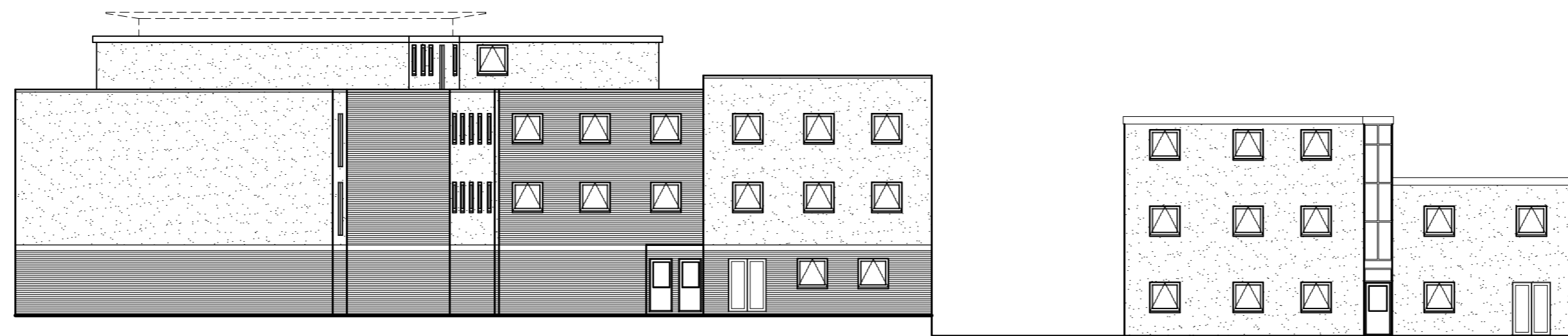
PROPOSED REAR ELEVATION SCALE 1:200

Project: RESIDENTIAL DEVELOPMENT 939-953 LONDON ROAD LEIGH-ON-SEA ESSEX Drawing title: SCHEME DESIGN PROPOSED STREETSCENES